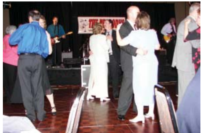
The Peabodys Band from Kansas City perform hit rock'n' roll tunes at the Presidents Dance to conclude the activities of MSPE's 69th Annual Convention.