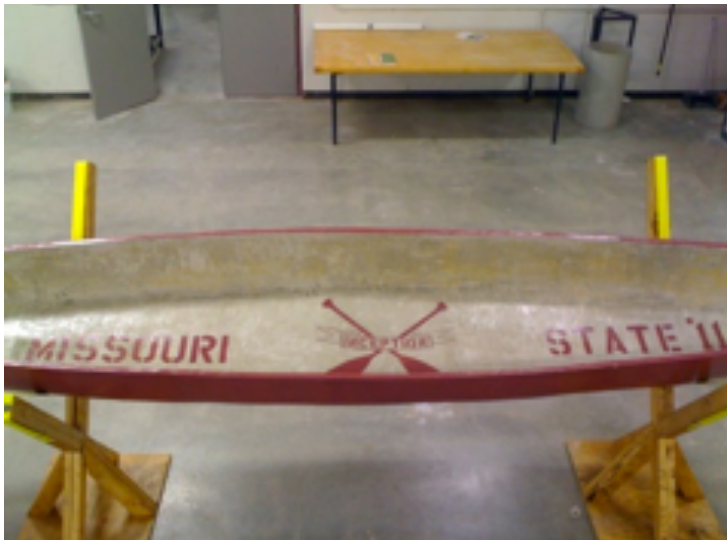
Looking down on the finished canoe and display stands.

hold regular rowing practices, incorporate more graphics into the finished product, and make the canoe thinner, lighter, and stronger using innovative materials and techniques.