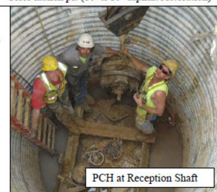
PCH at Reception Shaft