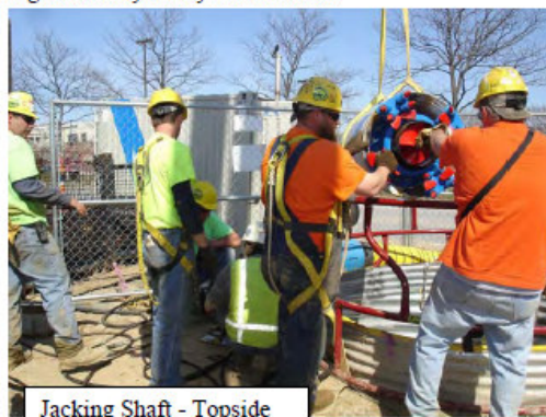
Jacking Shaft - Topside