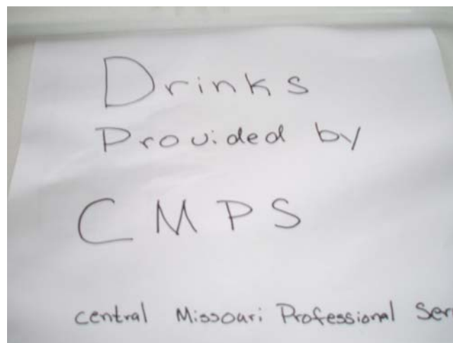
Above Picture: Again special thanks to the Central Missouri Professional Services for providing the drinks.