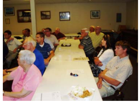
Middle-Right Pictures: MSPE members and guests listening attentively to the presentation.