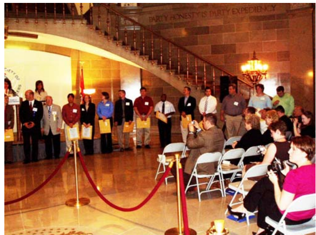
Above Row: Twenty seven new P.E.'s get their license in the MSPE ceremony.