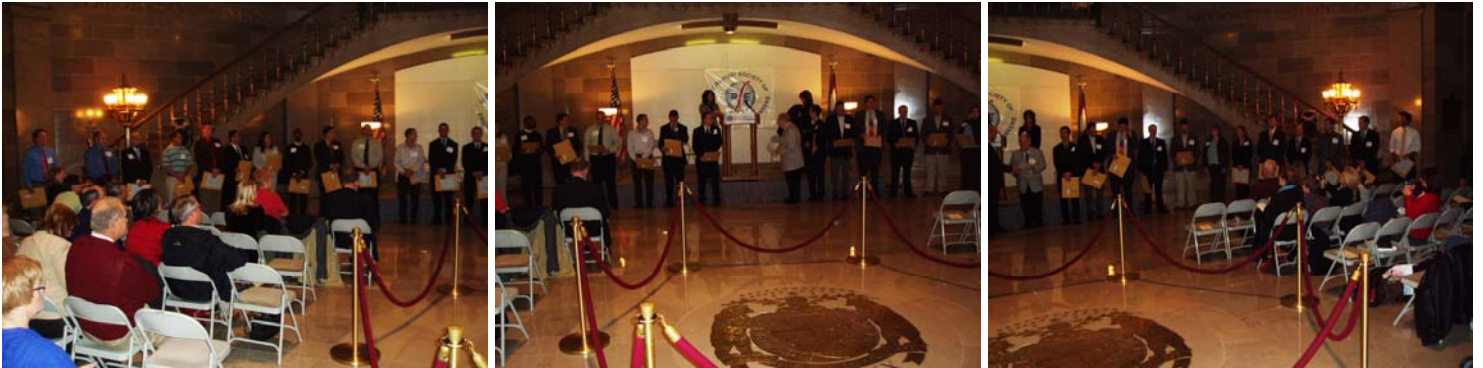
Above Row: Twenty five new P.E.'s get their license in the MSPE ceremony.